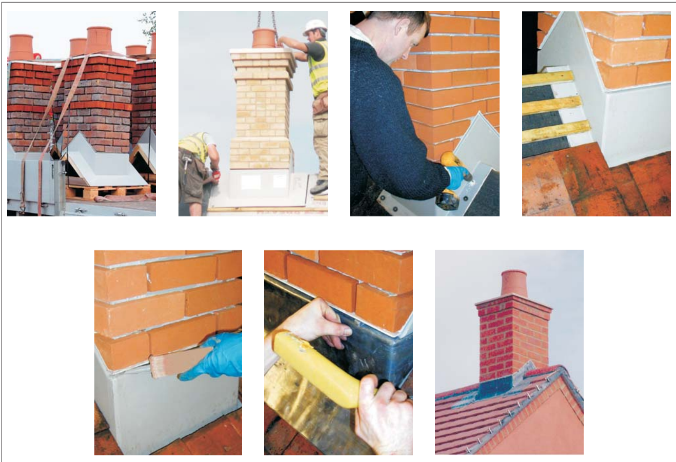
Figure 2 Installation Process

12.2 Prior to lifting into position on the roof, the joints between brick slips are pointed using a cement/lime/sand mix (1:½:4½) incorporating a waterproofing admixture. The pointing must fill the joints (typically from 20 mm to 25 mm) and be finished to a bucket handle joint profile. Advice on suitable admixtures is available from the Certificate holder.